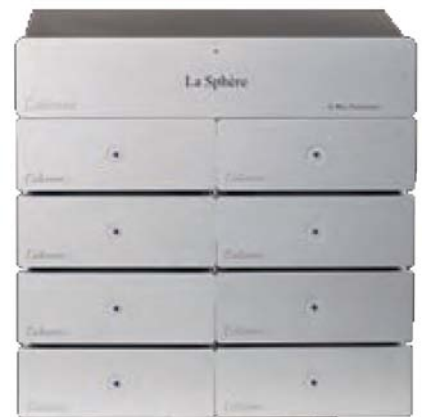
La Sphere Digital Processor and Amplifiers