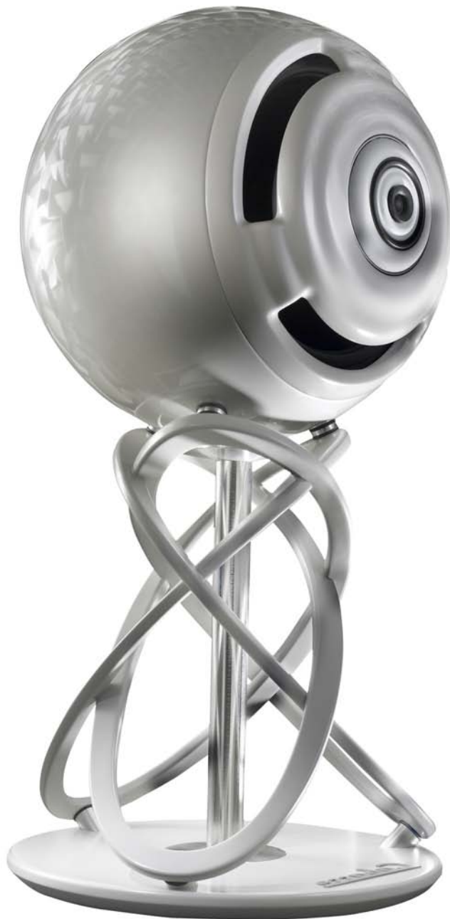
La Sphere - Pearl

Expression. Emotion. Experience. Dynamic range, power handling, acoustical accuracy in stereo and multichannel, exceptional width and depth of the sound image, Cabasse speakers have something that others don't have. Designed in Brittany, France in the Cabasse Acoustic Center, heir of 60 years of acoustic innovations, Cabasse technology offers new discoveries in sound day after day. Oceo, Idea, Artis. Three families of Cabasse loudspeakers create a wealth of sensations.