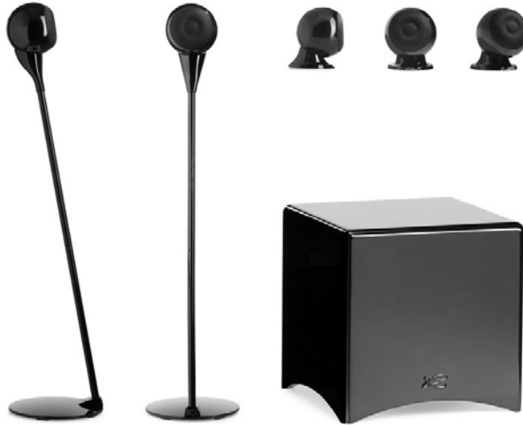
Eole 2 5.1 System: 5 x satellite, 1 x Santorin 21, cables, 2 x stands Eole 2 2.1 System: 2 x satellite, 1 x Santorin 21, cables