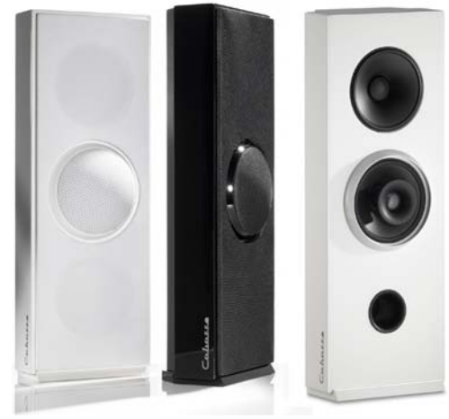
PHI Bookshelf / On-wall

With the PHI SYSTEM®, Cabasse proposes a Hi Fi / audio video system based on the Spatially Coherent Source (SCS) principles coming from our high end ARTIS range of speakers. With PHI satellite speakers combined with a Santorin 21 active subwoofer you will get a very high quality system, either in a 2.1 configuration (standard stereo) or in a 5.1 configuration (5 channel system) or 6.1 or 7.2... The bookshelf / on-wall model can be positioned vertically (as shown) or horizontally under or above a flat panel display.