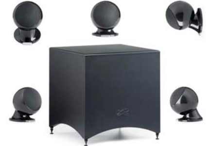
Alcyone 5.1 System: 5 x satellite 1 x Santorin 17 subwoofer cables