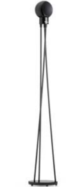
Stand Option for Alcyone satellite