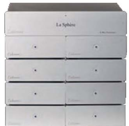
La Sphere Digital Processor and Amplifiers