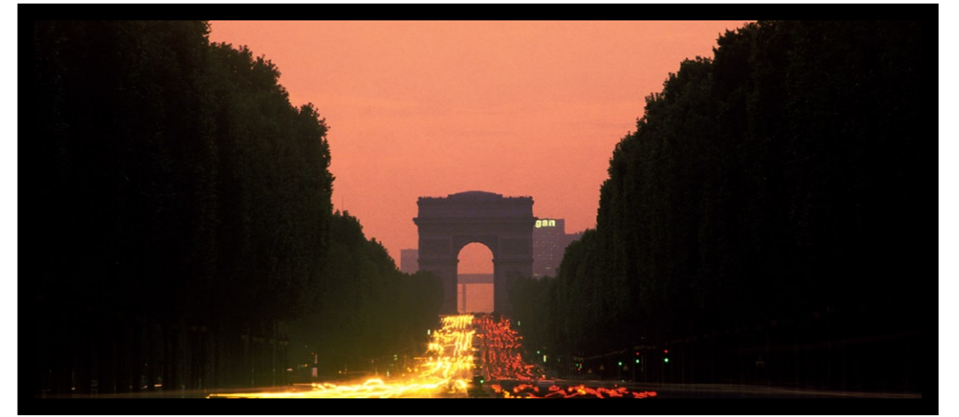
a movie on a 2.35 cinemascope screen